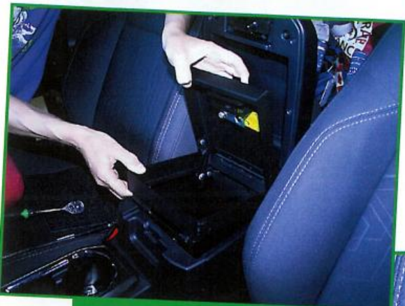
3. The Tuffy console insert is inserted into place and the mounting legs unfolded.