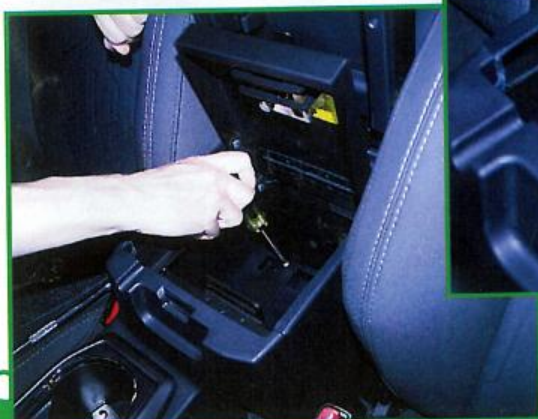
4. The lower mounting hardware is installed, then the carpet pad reinstalled.