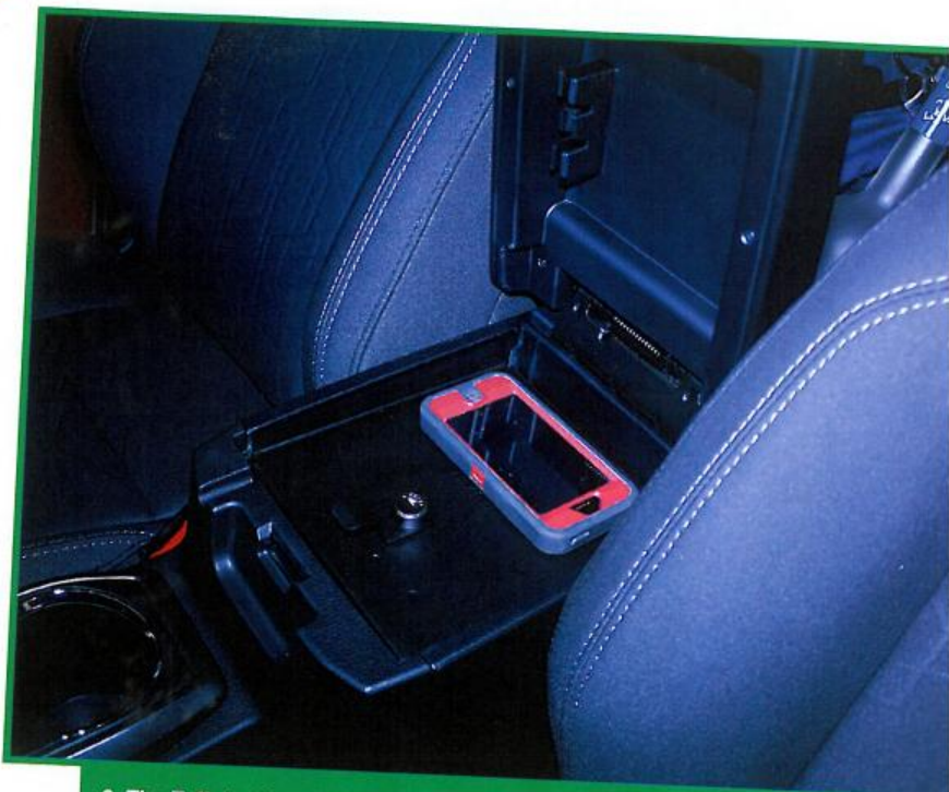
6. The Tuffy locking lid hides beneath the factory console lid, giving a factory appearance from the outside while also giving you room to store small items such as a phone.

Those who've had Tuffy before know they build good products, and this security console insert is no exception. Constructed from 16-gauge steel with a 10 tumbler, double bitted lock with their Pry-Guard locking system, the Tuffy insert is one tough box.