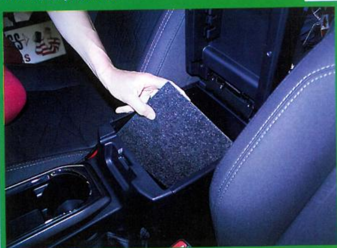
1. First step is to open the factory console and remove the carpet pad.

Sometimes the quick and easy installs give the most amount of satisfaction. Recently we installed a Tuffly security console insert. A big name for a great little product that was quick and easy to install. Tuffly ( www.tufflyproducts.com , 800-348-8339,) has been the big player in vehicle lockboxes for many years, making a great product at a reasonable price. We recently picked up a new 2017 Tacoma to play with and our very first mod was to add a little security to the inside by installing a Tuffly Security Console Insert (Tuffly PN# 324, $149).