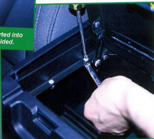
5. Followed by the side mounting hardware.