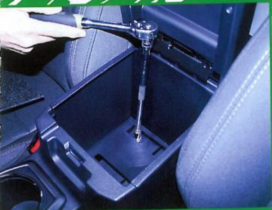
2. Next up is a ratchet, extension and 10mm socket to remove the lower mounting screws.